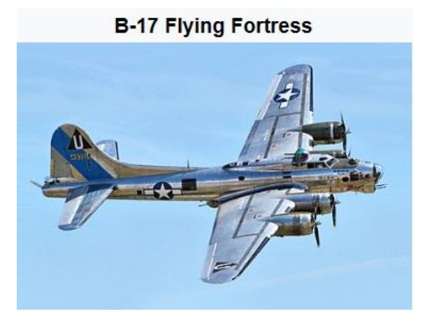
(Continued on page 4)

Join the Club on Thursday, February 15, 2024 for its luncheon meeting and tour of the Falcon Commemorative Air Force Museum. The registration form is available on page 9 or by clicking here. registrations are required by February 6, 2024.