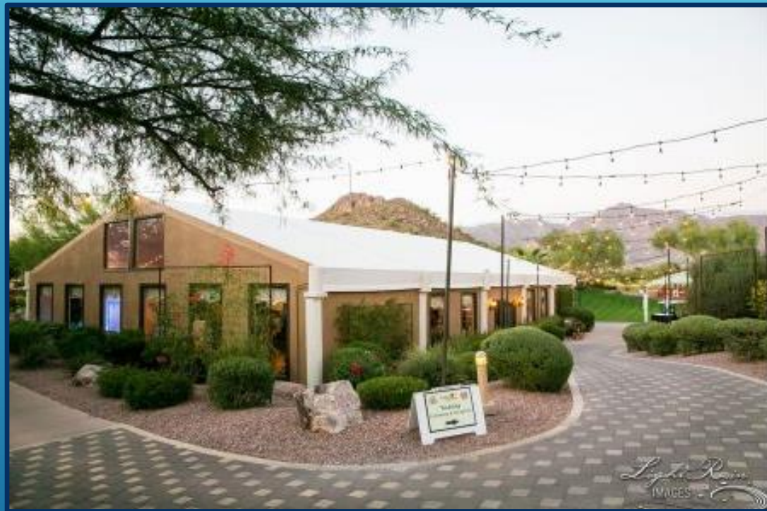
Gold Canyon Golf Resort Pavilion

6100 S Kings Ranch Rd, Gold Canyon, AZ 85118