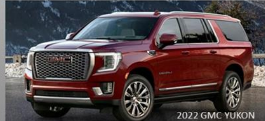
2022 GMC YUKON

Proud Sponsor - GM ALUMNI CLUB OF ARIZONA