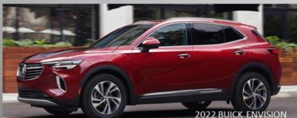
2022 BUICK ENVISION

Members receive $500 more value on their trade!