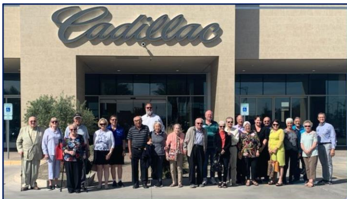
Thanks to Arrowhead Cadillac for providing bus transportation from the west valley to Gold Canyon.