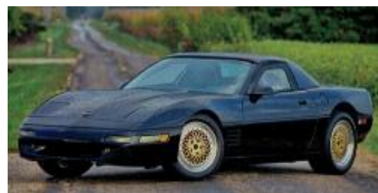
Virtual Twin of the CERV IV Produced by Moss's Group

The article has many more twists, turns, and details that you would definitely enjoy. Otherwise, strike up a conversation with Jon at one of the meetings and learn much more.