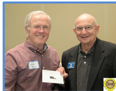
We DeCou - $20