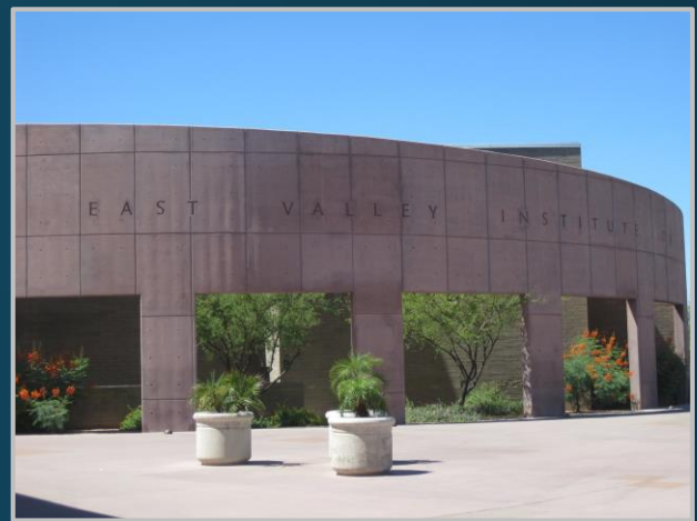
1601 W. Main Street, Mesa AZ