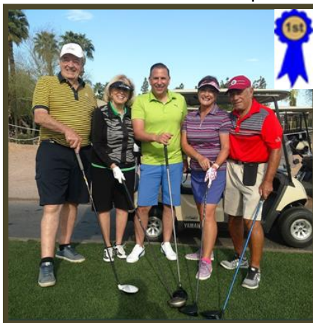
Team Low Net Winners:

On a beautifully sunny, 90° F day, 29 golfers teed it up on the Eagle’s Nest Golf Course at PebbleCreek for a competitive, yet friendly, round of golf. Awards were provided to each team along with gift bags for all golfers. We are extremely thankful to our Loyal Dealers – Arrowhead Cadillac , Courtesy Chevrolet , and Sands Chevrolet – for providing Gift Certificates for the 1 st and 2 nd place Low Net teams, and to the