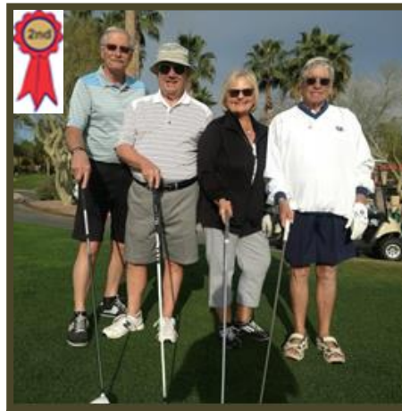
Team Low Net Runner-Up:

out of California for providing many great items that were used as raffle prizes following the luncheon. Prizes included wind breakers, golf shirts, tee shirts, sports bags and a nice Fossil watch. We are also very thankful for the support provided by Liberty Buick/GMC – another of our Loyal Dealers – and the GM Communications Group out of Detroit, as they also helped fill the gift bags with golf balls, sun glasses, cooler cups, golf towels, 6-pack can cooler bags, and numerous additional items.