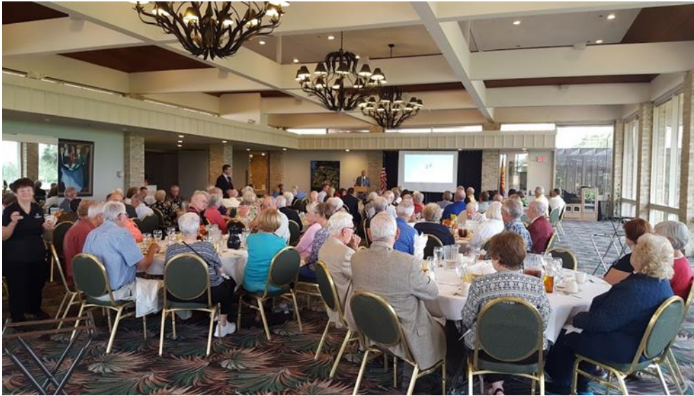
Members & Guests Enjoying the Presentation