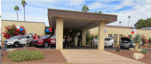
Palmbrook Country Club