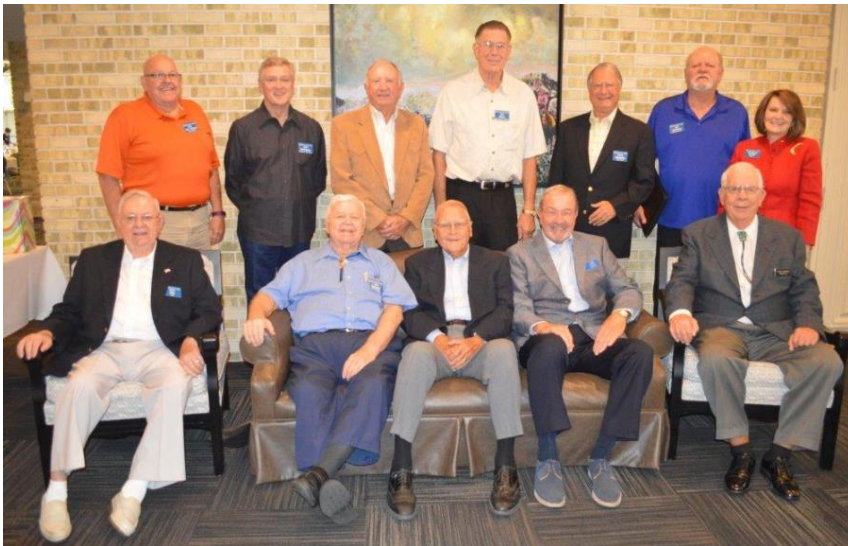
Eleven Past Presidents & Current President Attend Together