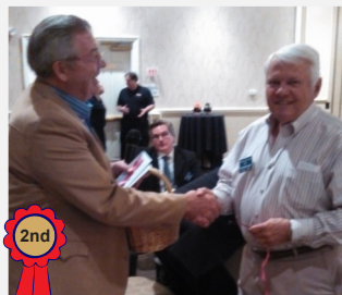
El Schlesinger $62