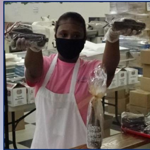
Solid Chocolate shapes