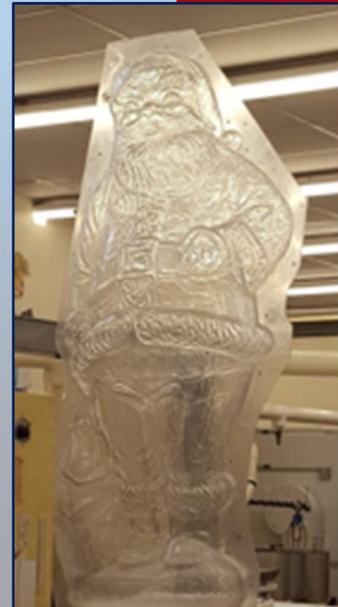
Life size Santa Clause Mold - 500 pounds of Chocolate!